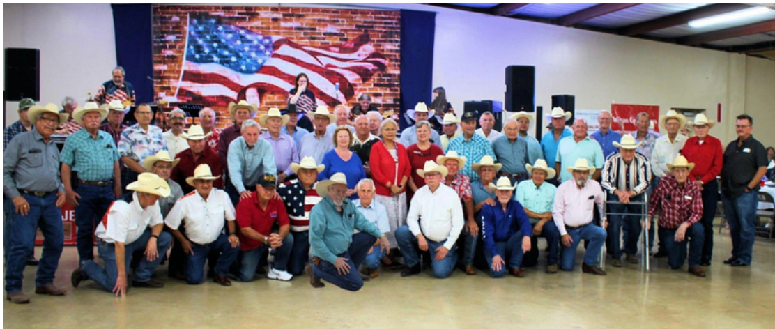
Veterans picture by Glenn Toothman. Veterans are recognized at the Floresville Opry several times a year.

The July Floresville Opry had a record breaking attendance with approximately 500 attendees. Viola and Neila came up with an idea to prepare a basket of goodies and do a $20 Arm Stretch Raffle at the Opry. It proved to be a hit earning around $1,000.00.